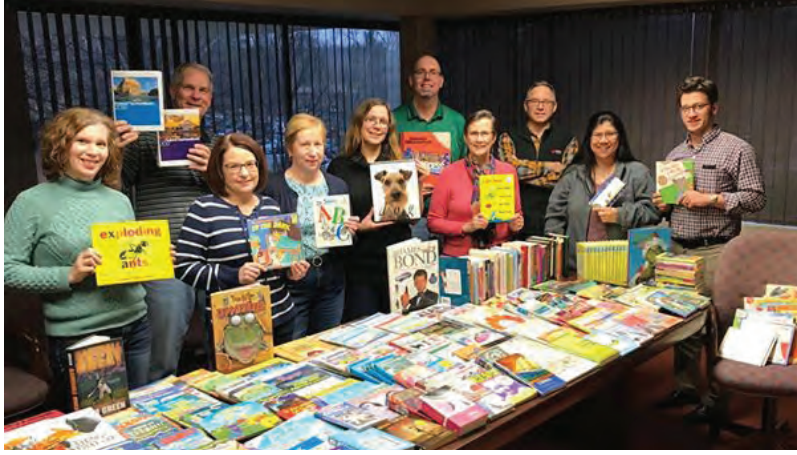
Connecticut's accounting community came together this holiday season to collect 2,366 new and gently used books for Read to Grow, an organization that promotes early literacy for Connecticut children. Pictured is the Harper & Whitfield team with their donations.

It is imperative for our members to stay connected to the local, regional, national, and worldwide community, including fellow professionals, future professionals, and the communities we serve. The profession has a long history of public service, and we are continuing to cultivate and nurture deep relationships beyond our membership base.