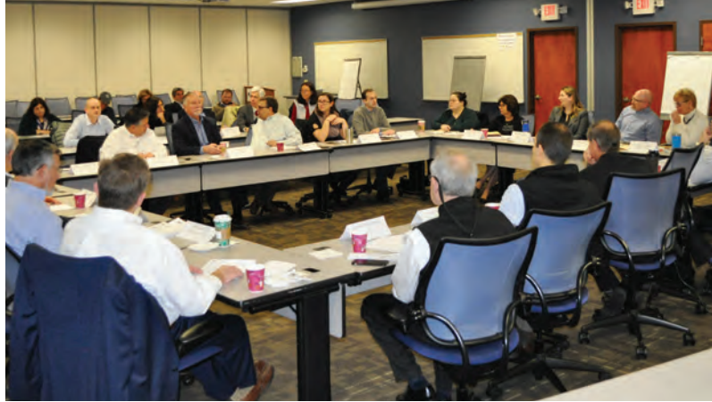
CTCPA State Taxation Committee members talk through pass-through entity tax questions at a recent meeting