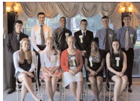
2011 ETF High School Scholarship Recipients

The scholarships were presented to Connecticut High School seniors who plan to continue on as accounting majors at a college or university in the Fall of 2011.